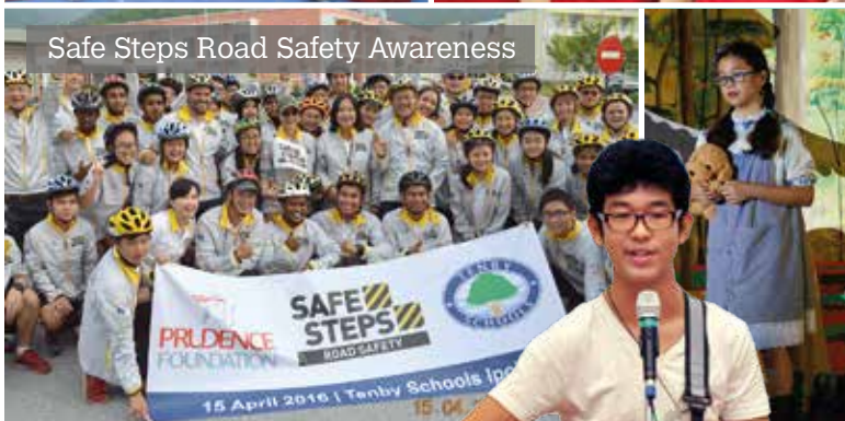
Safe Steps Road Safety Awareness