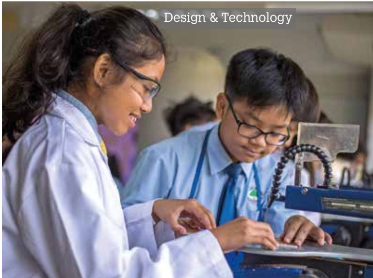
Design & Technology