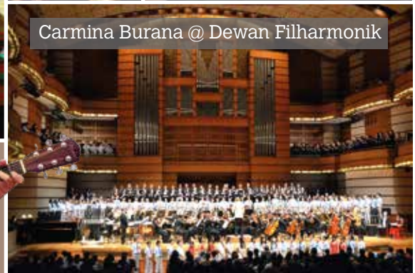
Carmina Burana @ Dewan Filharmonik