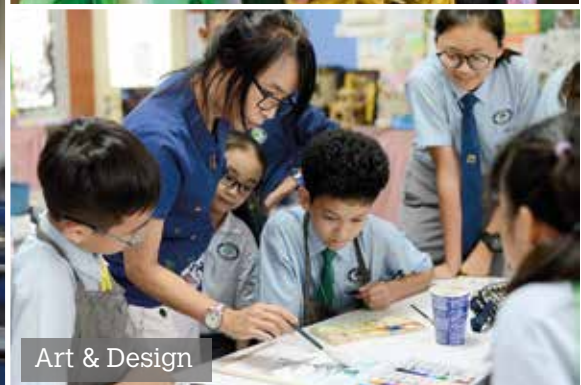
Art & Design